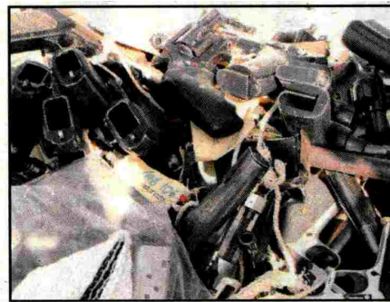
The guns that were involved in the commission of crimes were seized by the commissioner of police.